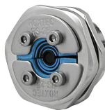
C RS T kit

For detailed information, please visit roxtec.com .